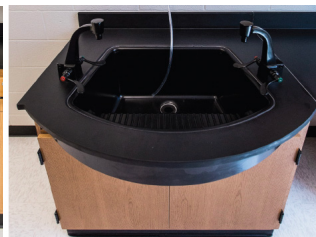
Synergy Sink in perimeter casework