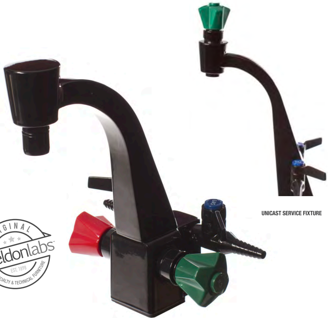
UNICAST SERVICE FIXTURE