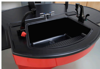
Synergy Sink in Axis Infinity Table

Standard epoxy color is black. Limited variety of colors available at additional charge.