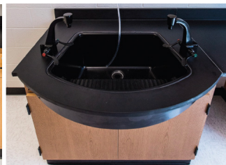
Synergy Sink in perimeter casework